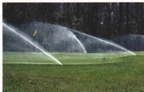
Sand-based greens usually have become somewhat water-repellent by the time they are 2 years old.

We have done either field or greenhouse stud-