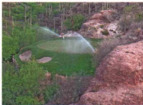
Using a wetting agent maximizes the use of irrigation water on greens.

Most putting greens in the U.S. are constructed with a sand-based root zone. However, the following discussion applies to both sand-based greens and push-up greens if the push-up green has anywhere from 2 inches (5.0 centimeters) or more of a sand or sand/organic matter mix over the original soil base. With this in mind,